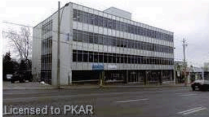
Licensed to PKAR